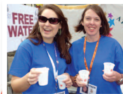
At the Sydney 2000 Games, 250,000 cups of free water were distributed to visitors

Genuine faith is always expressed through generous and welcoming hospitality. More Than Gold's aim is for the 2012 Games to be renowned for the level of hospitality offered to overseas visitors by the UK's Christians.